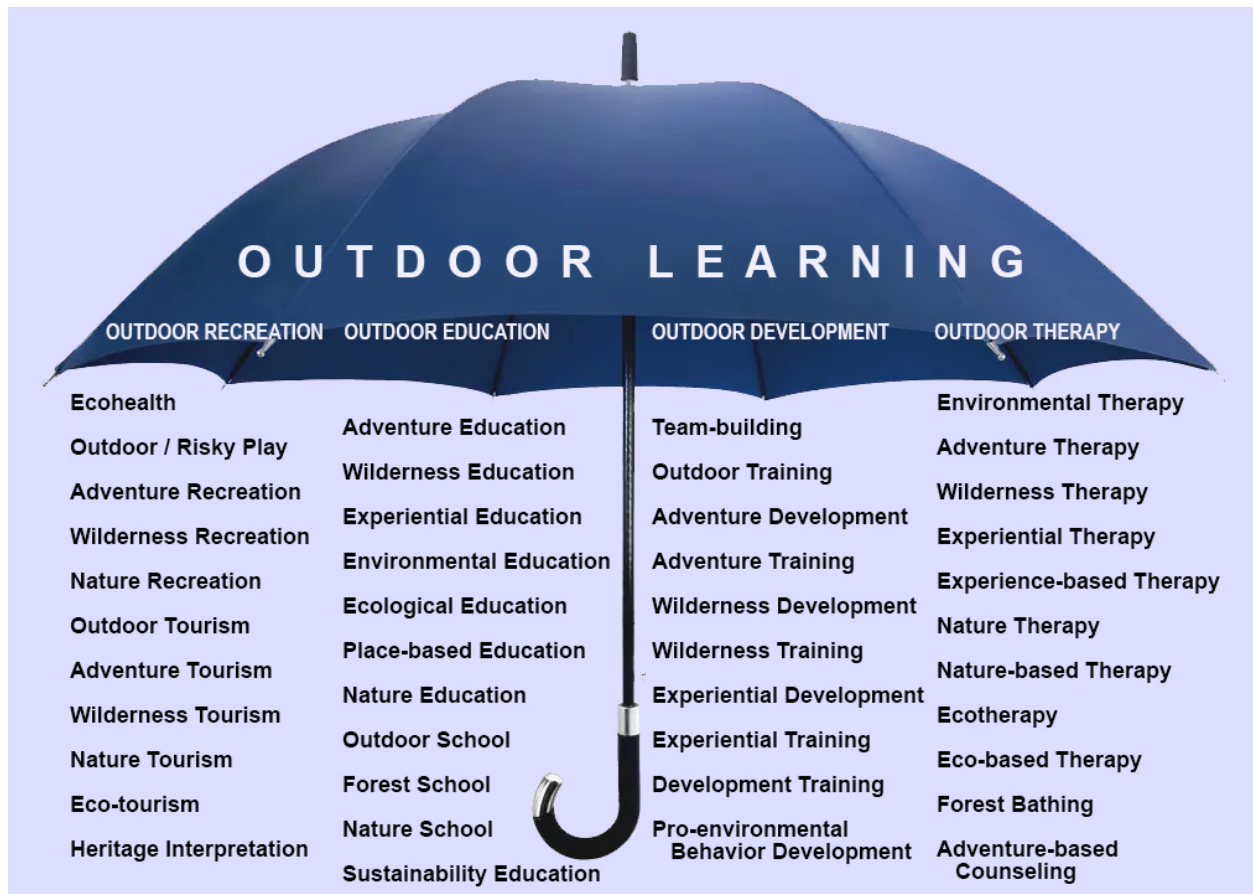
Figure 1: The umbrella term of outdoor learning covers a wide variety of similar programming.